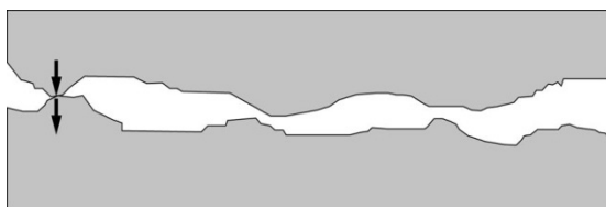
Just one point is contacting.